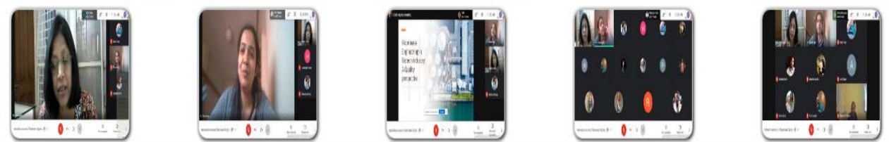
Online Interactive Guest Lecture On "Bioprocess Engineering in Biotech Companies" 05 April 2021