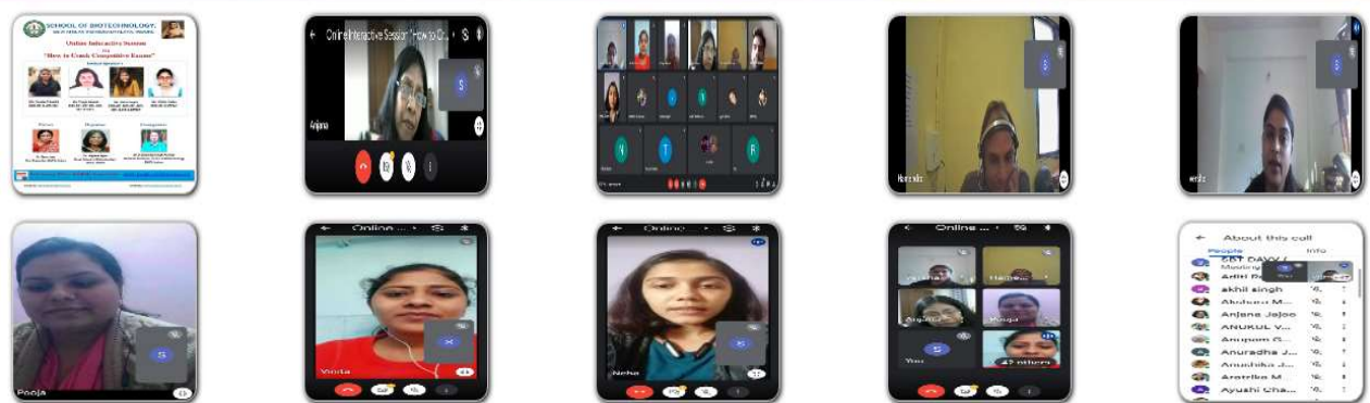
Online Interactive Session on "How to Crack Competitive Exams" 12 February 2022