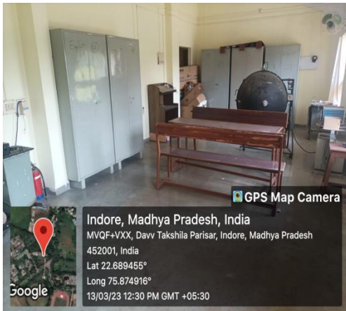
Energy conservation lab