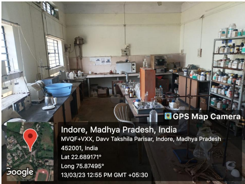
Bio Mass lab