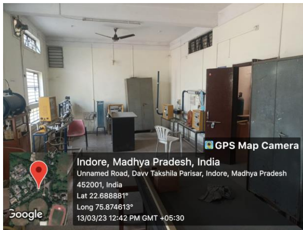
Heat and Mass transfer lab