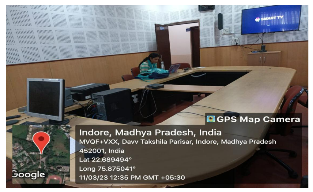
F-1: Board room

4.3.1 Percentage of classrooms and seminar halls with ICT - enabled facilities such as LCD, smart board, Wi-Fi/LAN, audio video recording facilities(Data for the latest completed academic year)