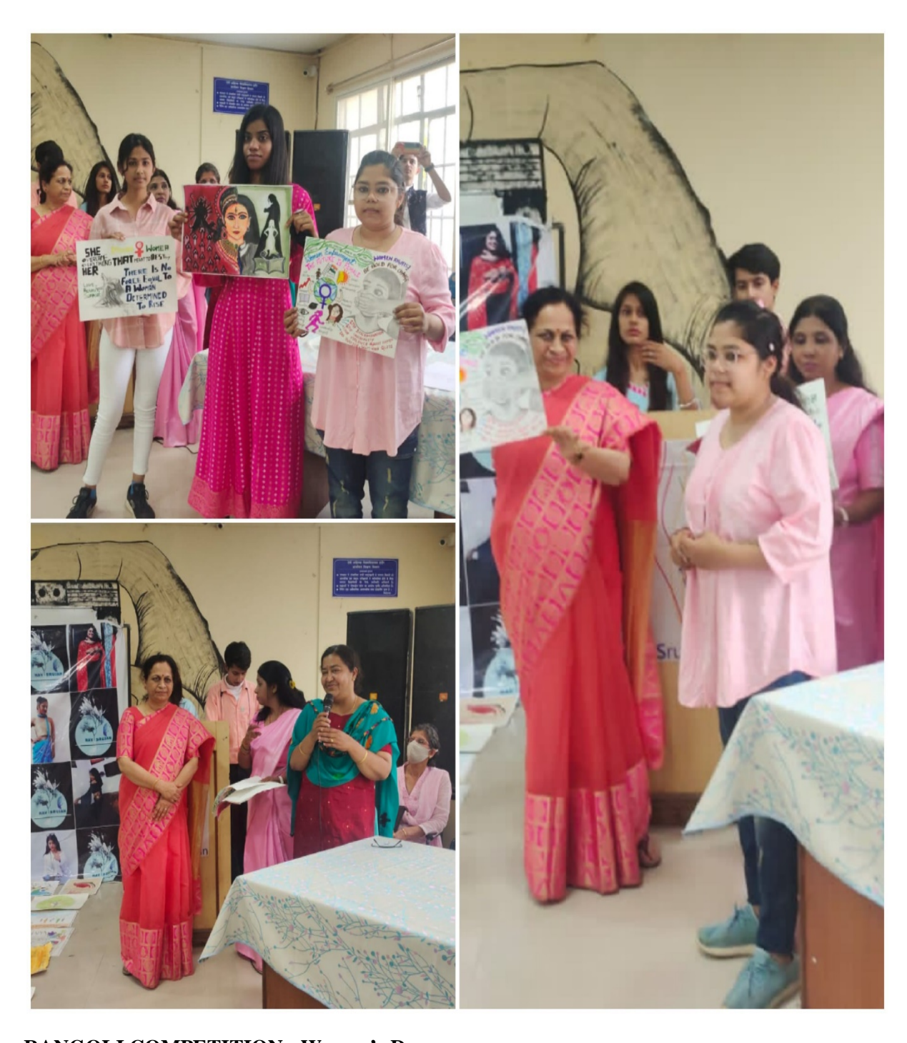
RANGOLI COMPETITION - Women's Day

In Rangoli competition 6 participants take actively part with full of interest and creative ideas and make wonderful rangoli on the occasion of women's day and select best three artist who makes creative rangoli. List of winners -