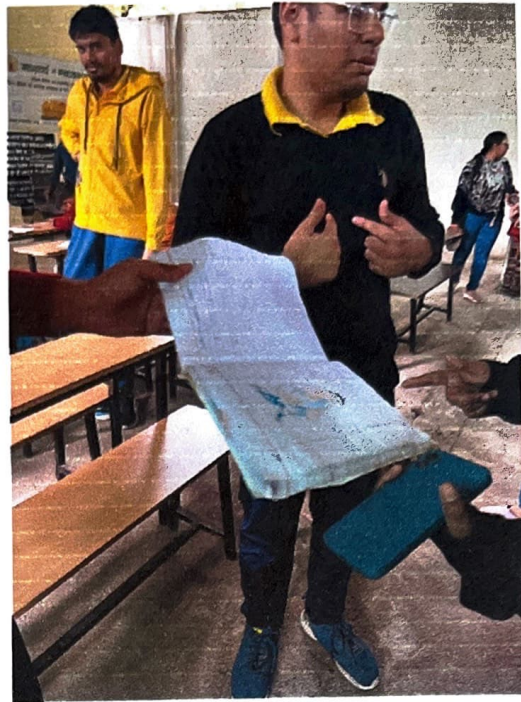
Kids and adults at Arunabh