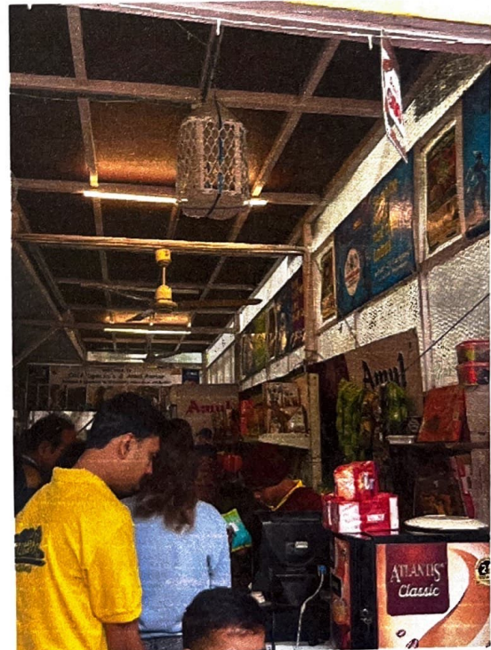
Café run by autistic kids at Arunabh centre