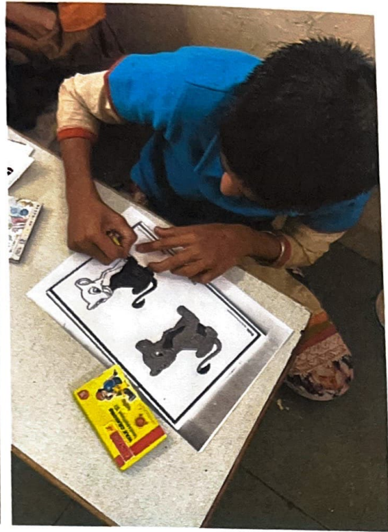
Place of gathering and Art Therapy.