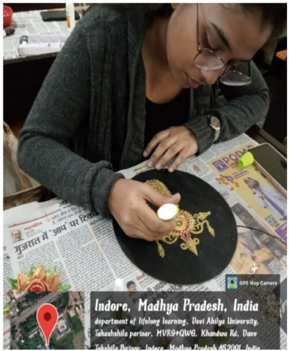
Indore, Madhya Pradesh, India department of lifelong learning, Devi Ahilya University, Takashshila parisar, MVR9+QWG, Khandwa Rd, Davv Takhshila Parisar, Indore, Madhya Pradesh 462001, India