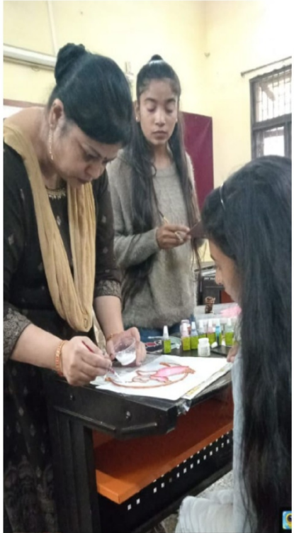
Indore, Madhya Pradesh, department of lifelong learning, Devi Ahilya Un Takashshila parisar, MVR9+QWG, Khandwa R Takhshila Parisar, Indore, Madhya Pradesh 4620 Lat 22.691974° Long 75.869816° 16/12/22 12:44 PM GMT +05:30