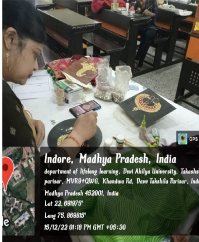
Indore, Madhya Pradesh, India department of lifelong learning, Devi Ahilya University, Takashsh parisar, MVR9+QWG, Khandwa Rd, Davv Takshila Parisar, Ind Madhya Pradesh 462001, India Lat 22.691975° Long 75.869815° 16/12/22 01:18 PM GMT +05:30