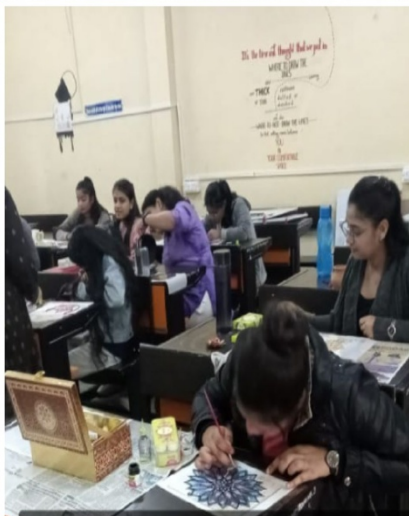
Indore, Madhya Pradesh, India department of lifelong learning, Devi Ahilya University, parisar, MVR9+QWG, Khandwa Rd, Davu Takshila Madhya Pradesh 452001, India Lat 22.691974° Long 75.869816° 15/12/22 12:40 PM GMT +05:30