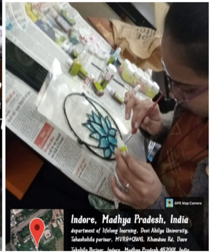
Indore, Madhya Pradesh, India department of lifelong learning, Devi Ahilya University, Takashshila parisar, MVR9+QWG, Khandwa Rd, Davv Takhshila Parisar, Indore, Madhya Pradesh 462001, India