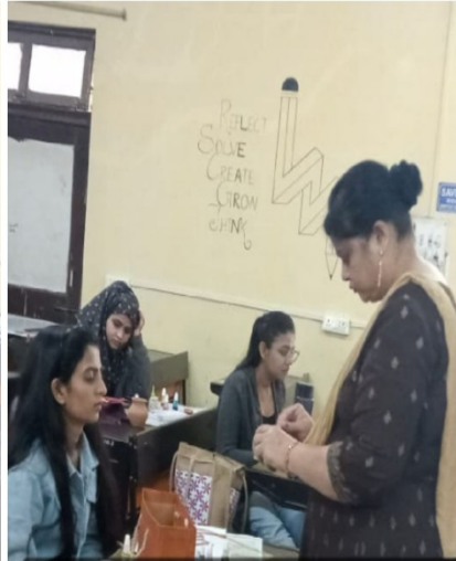
Indore, Madhya Pradesh, India department of lifelong learning, Devi Ahilya University, parisar, MVR9+QWG, Khandwa Rd, Davu Takshila Madhya Pradesh 452001, India Lat 22.691975° Long 75.869815° 15/12/22 12:42 PM GMT +05:30