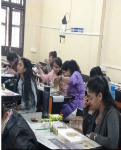
Indore, Madhya Pradesh, India department of lifelong learning, Devi Ahilya University, parisar, MVR9+QWG, Khandwa Rd, Davu Takshila Madhya Pradesh 452001, India Lat 22.691974° Long 75.869816° 15/12/22 12:40 PM GMT +05:30