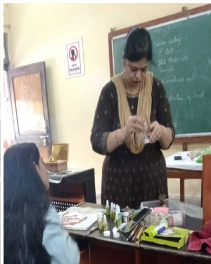
Indore, Madhya Pradesh, India department of lifelong learning, Devi Ahilya University, Takshashila parisar, MVR9+QWG, Khandwa Rd, Davu Takshila Parisar, Indore, Madhya Pradesh 462001, India Lat 22.691989° Long 75.869814° 15/12/22 12:42 PM GMT +05:30