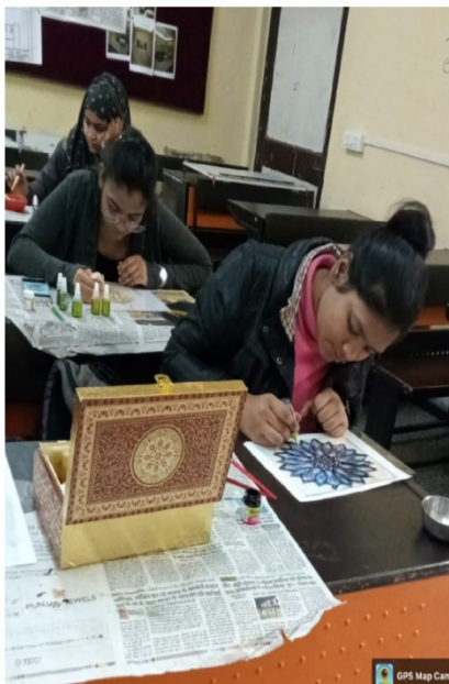
Indore, Madhya Pradesh, India department of lifelong learning, Devi Ahilya University, Takshashila parisar, MVR9+QWG, Khandwa Rd, Davu Takshila Parisar, Indore, Madhya Pradesh 462001, India Lat 22.691988° Long 75.869816° 15/12/22 12:43 PM GMT +05:30