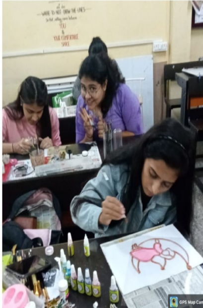
Indore, Madhya Pradesh, India department of lifelong learning, Devi Ahilya University, Takshashila parisar, MVR9+QWG, Khandwa Rd, Davu Takshila Parisar, Indore, Madhya Pradesh 462001, India Lat 22.691974° Long 75.869816° 15/12/22 12:41 PM GMT +05:30