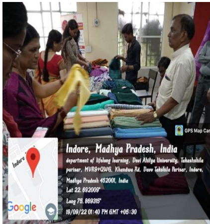
Indore, Madhya Pradesh, India department of lifelong learning, Devi Ahilya University, Takashahila parisar, MVR9+QWG, Khandua Rd., Davu Takshila Parisar, Indore, Madhya Pradesh 462001, India Lat 22.892009° Long 75.869384° 19/09/22 01:40 PM GMT +05:30