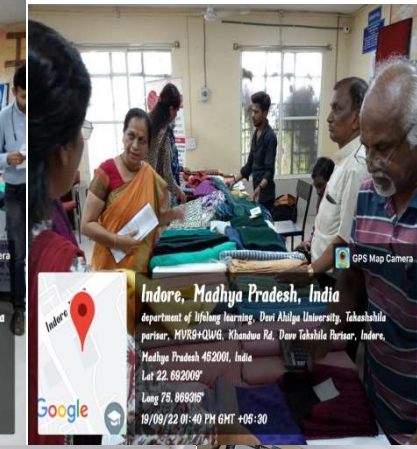
Indore, Madhya Pradesh, India department of lifelong learning, Devi Ahilya University, Takashahila parisar, MVR9+QWG, Khandua Rd., Davu Takshila Parisar, Indore, Madhya Pradesh 462001, India Lat 22.892009° Long 75.86938° 19/09/22 01:40 PM GMT +05:30