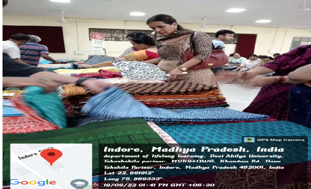
Indore, Madhya Pradesh, India department of lifelong learning, Devi Ahilya University, Takashahila parisar, MVR9+QWG, Khandua Rd., Davu Takshila Parisar, Indore, Madhya Pradesh 462001, India Lat 22.891912° Long 75.869333° 19/09/22 01:41 PM GMT +05:30