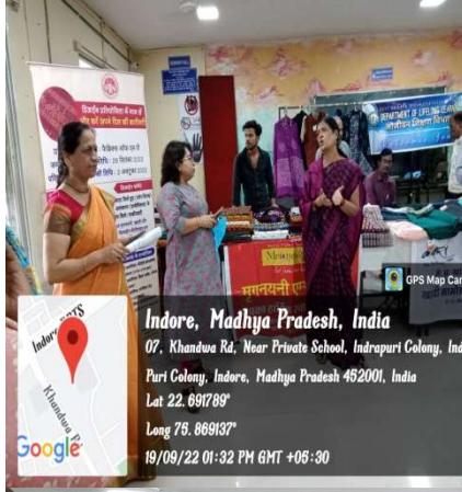
Indore, Madhya Pradesh, India 07, Khandua Rd., Near Private School, Indrapuri Colony, Indra Puri Colony, Indore, Madhya Pradesh 462001, India Lat 22.891789° Long 75.869137° 19/09/22 01:32 PM GMT +05:30