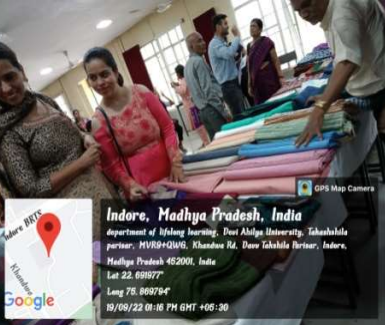
Indore, Madhya Pradesh, India department of lifelong learning, Devi Ahilya University, Takashahila parisar, MVR9+QWG, Khandua Rd., Davu Takshila Parisar, Indore, Madhya Pradesh 462001, India Lat 22.891977° Long 75.869784° 19/09/22 01:16 PM GMT +05:30