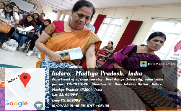
Indore, Madhya Pradesh, India department of lifelong learning, Devi Ahilya University, Takashahila parisar, MVR9+QWG, Khandua Rd., Davu Takshila Parisar, Indore, Madhya Pradesh 462001, India Lat 22.891984° Long 75.869392° 19/09/22 01:46 PM GMT +05:30