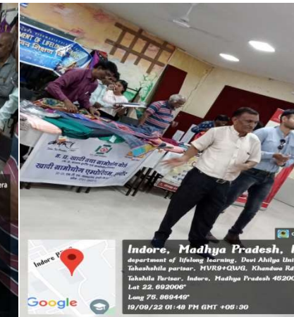
Indore, Madhya Pradesh, India department of lifelong learning, Devi Ahilya University, Takashahila parisar, MVR9+QWG, Khandua Rd., Davu Takshila Parisar, Indore, Madhya Pradesh 462001, India Lat 22.892009° Long 75.869444° 19/09/22 01:48 PM GMT +05:30