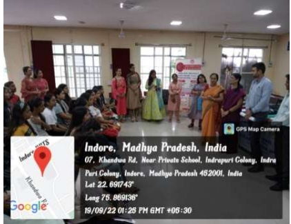
Indore, Madhya Pradesh, India 07, Khandua Rd., Near Private School, Indrapuri Colony, Indra Puri Colony, Indore, Madhya Pradesh 462001, India Lat 22.891743° Long 75.869138° 19/09/22 01:25 PM GMT +05:30