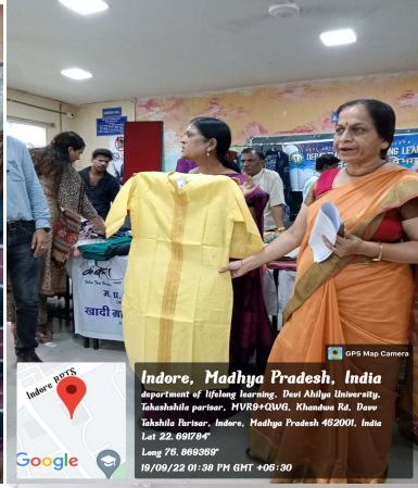
Indore, Madhya Pradesh, India department of lifelong learning, Devi Ahilya University, Takashahila parisar, MVR9+QWG, Khandua Rd., Davu Takshila Parisar, Indore, Madhya Pradesh 462001, India Lat 22.891984° Long 75.869389° 19/09/22 01:38 PM GMT +05:30