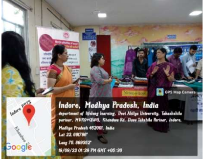
Indore, Madhya Pradesh, India department of lifelong learning, Devi Ahilya University, Takashahila parisar, MVR9+QWG, Khandua Rd., Davu Takshila Parisar, Indore, Madhya Pradesh 462001, India Lat 22.891786° Long 75.869352° 19/09/22 01:29 PM GMT +05:30