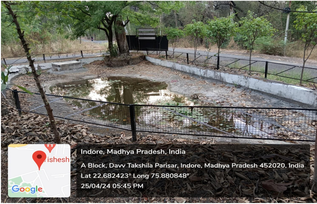
Institute of Engineering and Technology