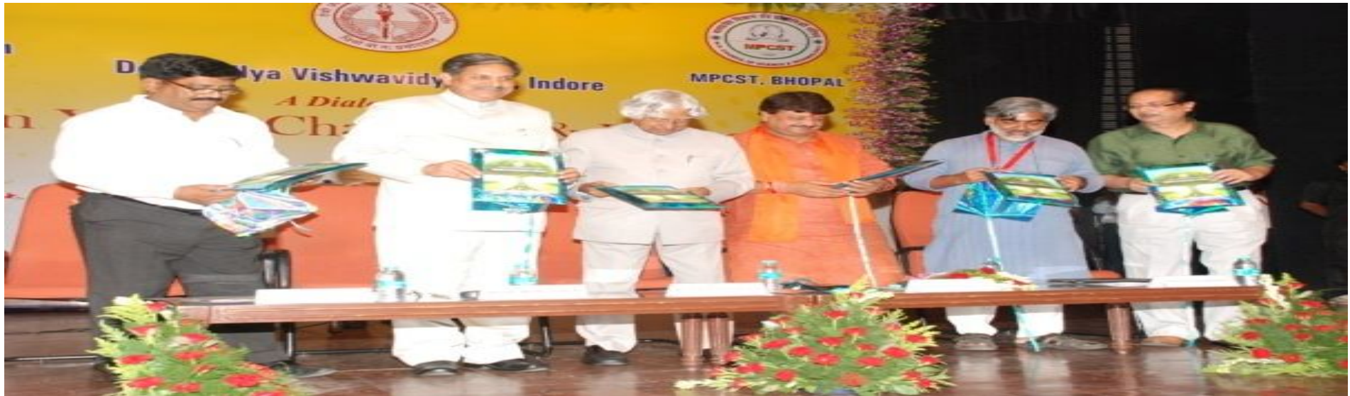
Green University Policy inaugurated by Dr. A.P.J. Abdul Kalam