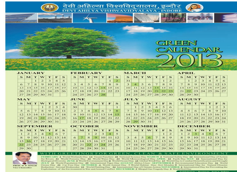
Green Calendar- 2013

Energy Audit of 25 Departments of University.